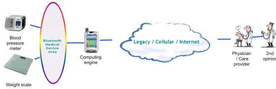
Figure 2. Medical Profile use - streaming and non streaming data – sharing of data with remote care provider