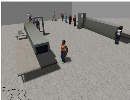
Figure 2. Screenshot of the airport simulation